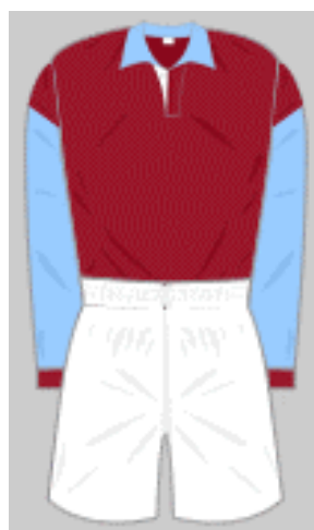
Lybster Portland Season – 1974