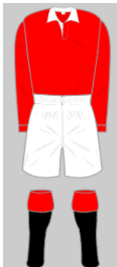
Wick Groats Season – 1937-38