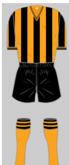
Lybster Portland Season – 1964

# Wick Rovers had replaced Wick Academy in local football competitions.