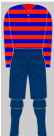
Thistle Season – 1899-00