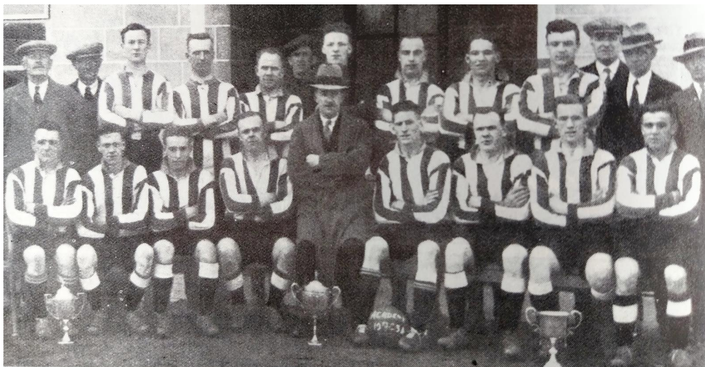
Wick Academy Season – 1933-34