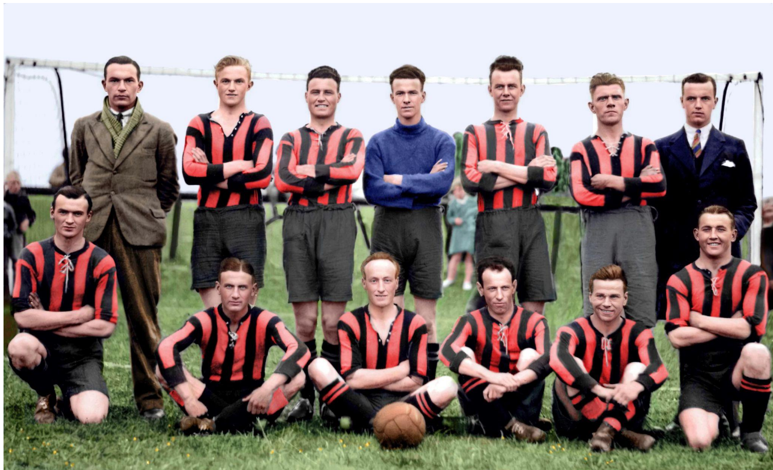
Halkirk Football Club Season – Unknown