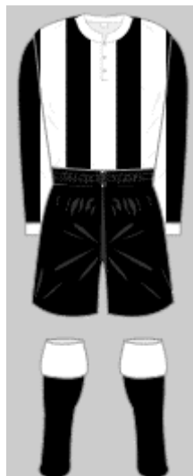
Wick Academy Season – 1946-47