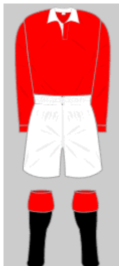
Wick Groats Season – 1947-48