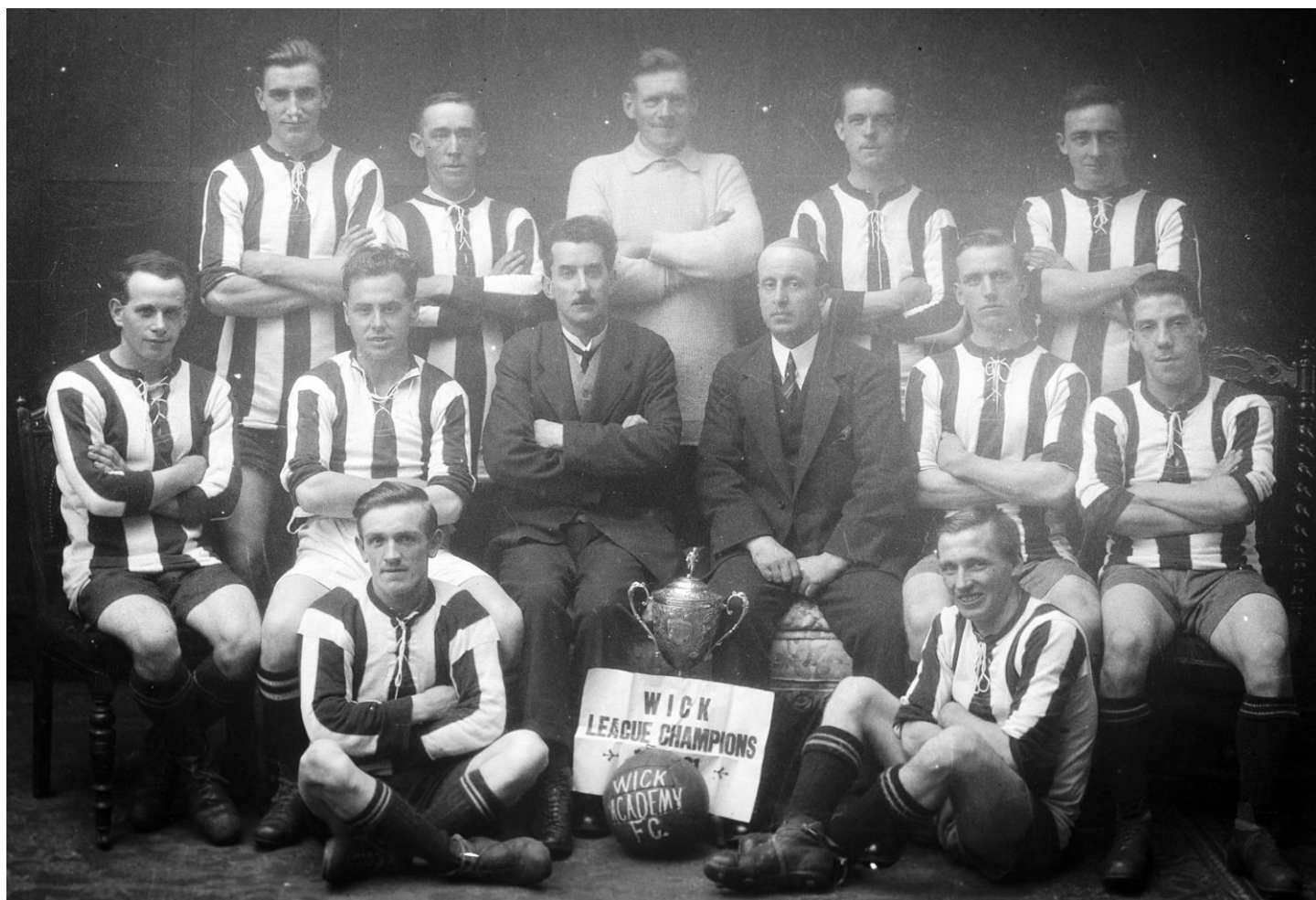
Wick Academy Season – 1928-29

#All match dates as results appear in John O’Groat Journal