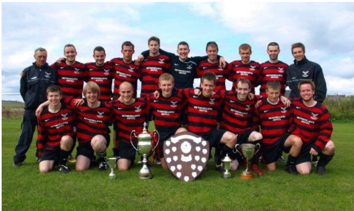
Wick Groats Season – 2009

County League & Wick Senior League Champions & David Allan Shield winners