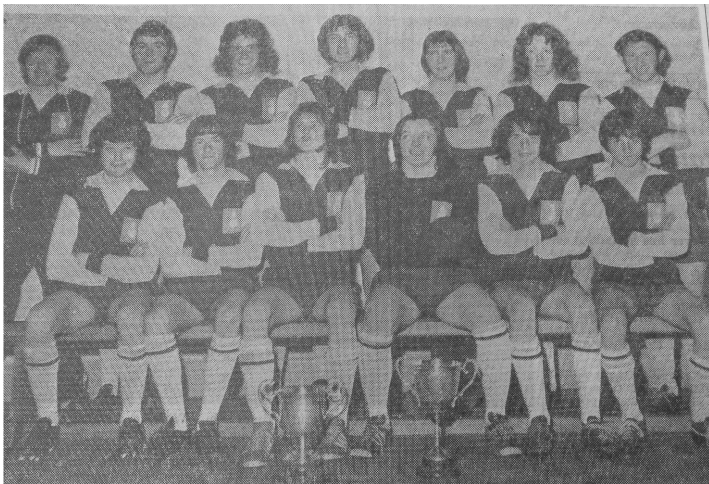
Lybster Portland Season – 1973