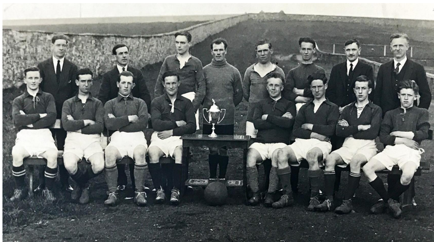
Wick Groats Season – 1928-29