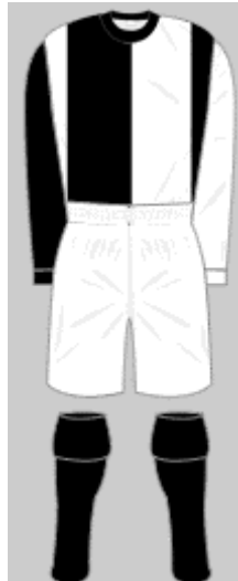
Academy Season – 1900-01