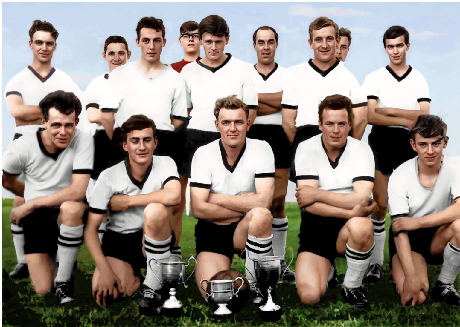
Halkirk Football Club Rural League, Abrach Mackay & Barton Robertson Cup winners