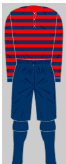
Pulteney Thistle Season – 1897-98