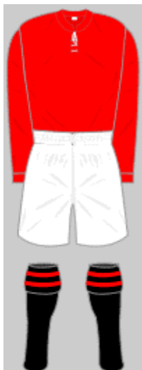
Wick Groats Season – 1932-33