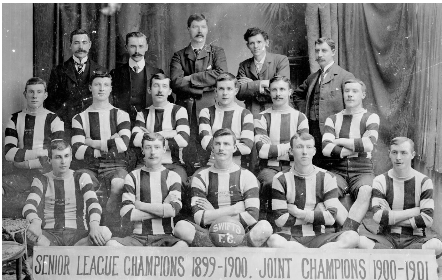
Thurso Swifts Season – 1900-01 (Joint) Thurso F.A. Senior League winners

Swifts shared the League title with Academicals