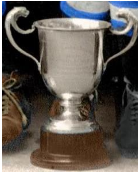
A. J. Mackay Cup