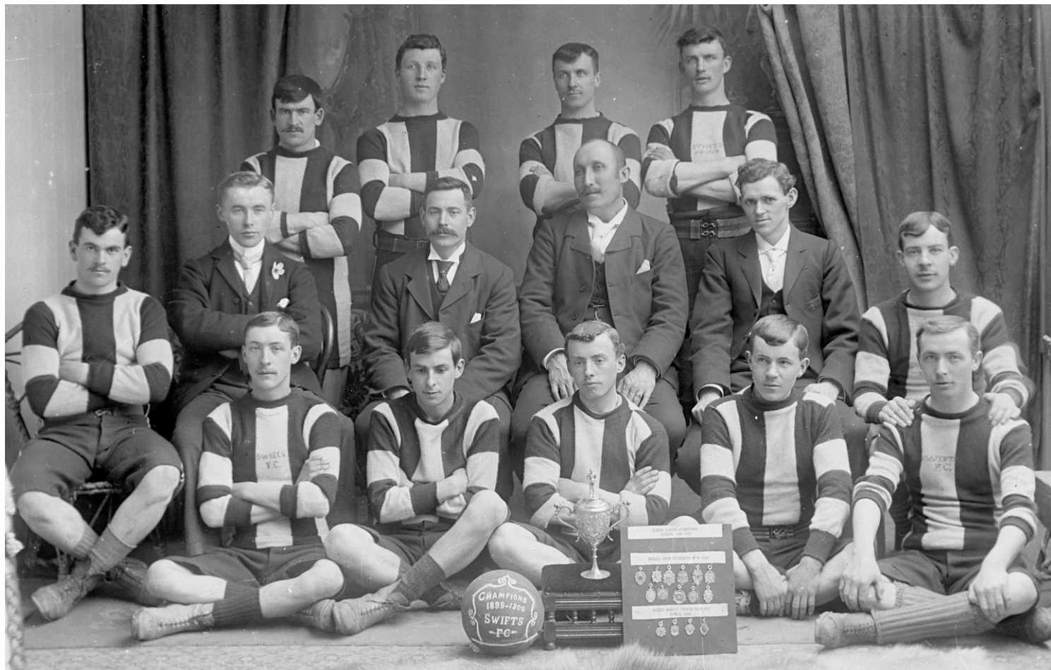
Thurso Swifts Season – 1899-00 Thurso F.A. Senior League Champions

Actually, Swifts are Thurso's oldest surviving club. They came into being a year before Academicals but were moribund (disbanded) a few years between 1900-1910 and later again dropped out for seven seasons when adversity became too regularly severe. Swifts in their dark days found it hard to retain promising young players who naturally preferred to find places in a winning combine and on occasions failed to muster a complete eleven.