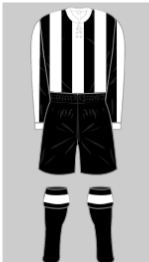
Wick Academy Season – 1929-30

#Matches not played due to Thistle already champions