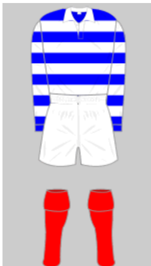
Wick Rovers Season – 1972