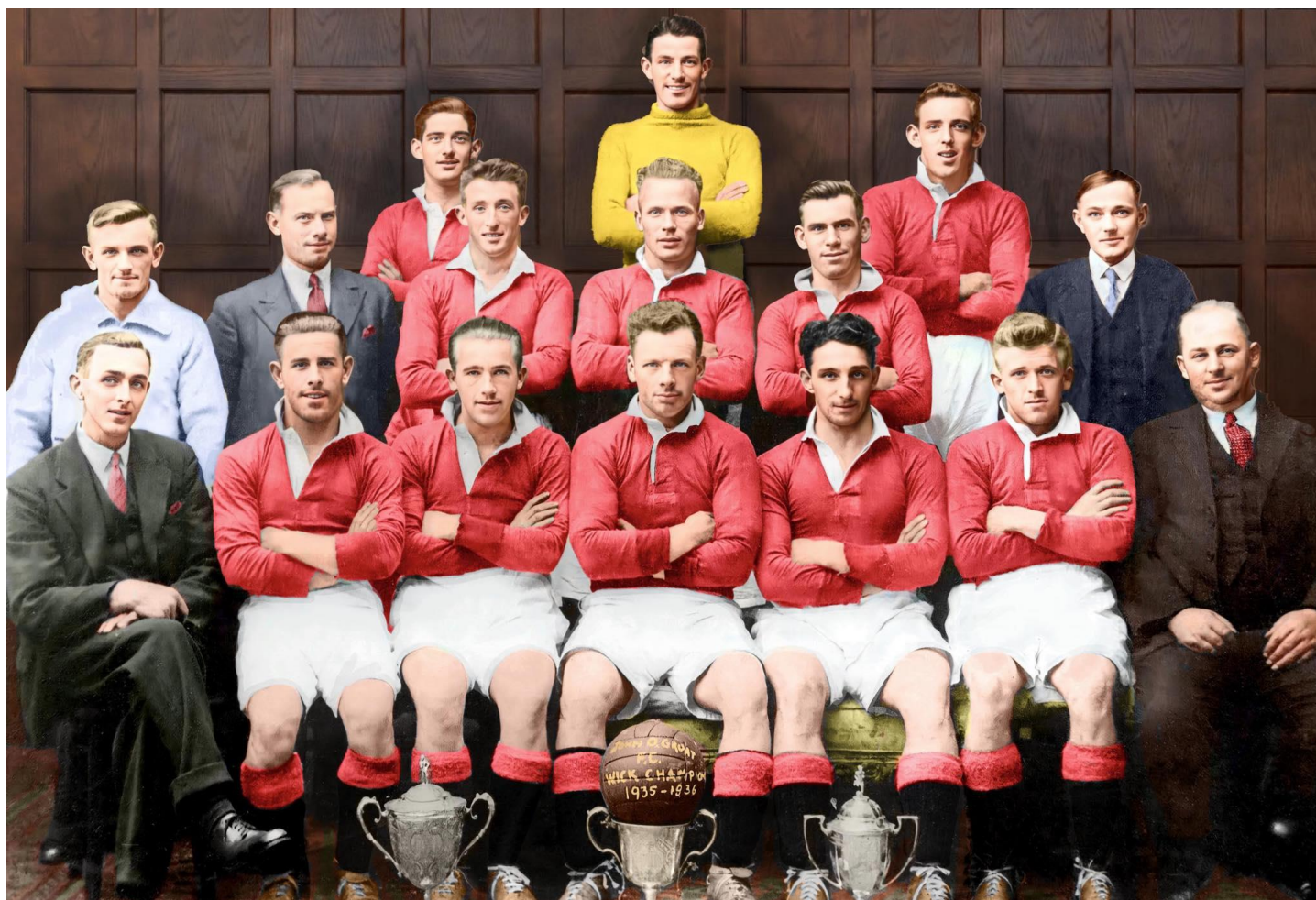
Wick Groats Season – 1935-36

Wick Senior League; Charity & Duncan Cup winners