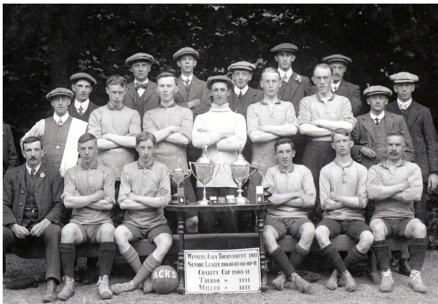
Thurso Academicals Season – 1911 Thurso Senior League; Charity, Miller & Thurso Cup winners