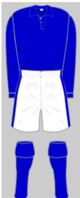
Wick Thistle Season – 1946-47