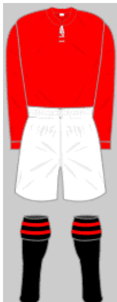
Wick Groats Season – 1925-26