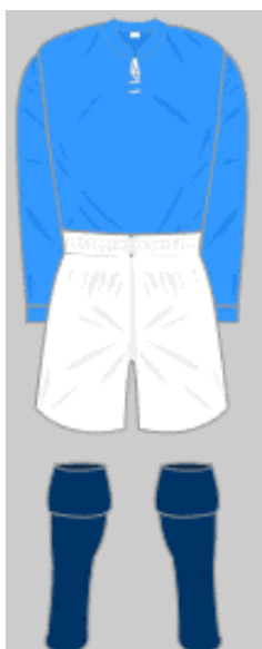
Wick Thistle Season 1923-24