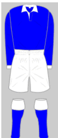
Wick Thistle Season - 1960

#This was the first season of summer football after the switch from winter football and Wick Academy unable to participate due to S.F.A. restrictions.