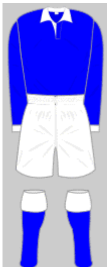
Wick Thistle Season – 1959