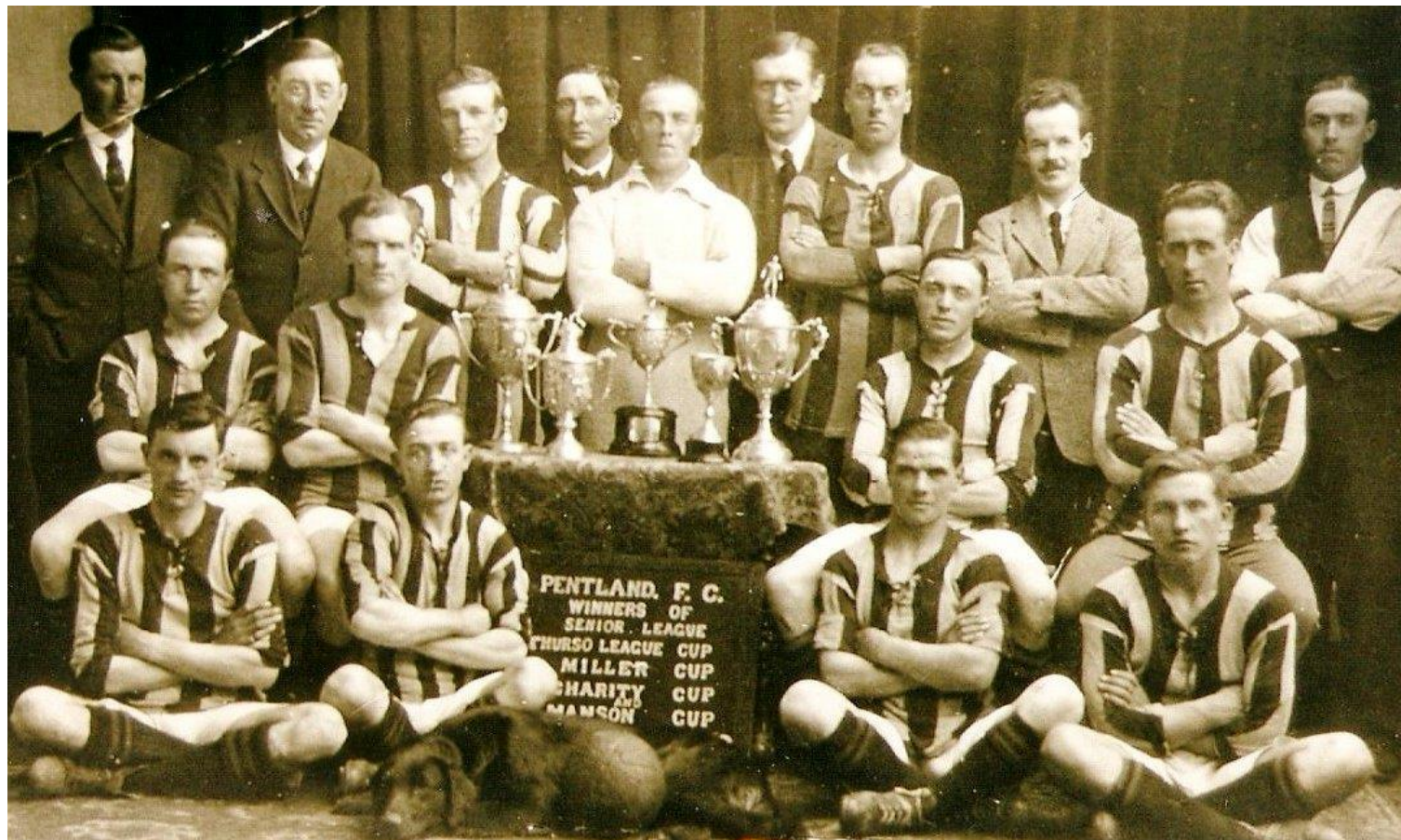
Thurso Pentland Season – 1922-23

Thurso F.A. Senior League; Charity, Miller, Manson & Thurso Cup winners