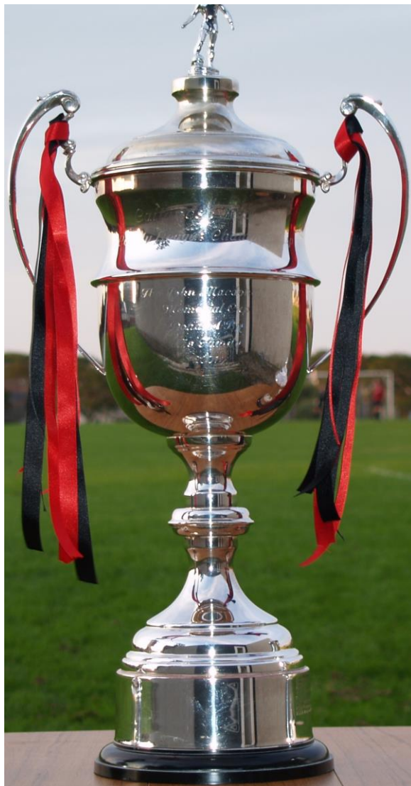
John Macdonald Memorial Cup

2002 – Wick Thistle 2003 – Pentland United 2004 – Pentland United 2005 – Thurso Academicals 2006 – Pentland United 2007 – Castletown 2008 – Pentland United 2009 – Wick Groats 2010 – Wick Groats 2011 – Pentland United 2012 – Wick Groats 2013 – Wick Groats