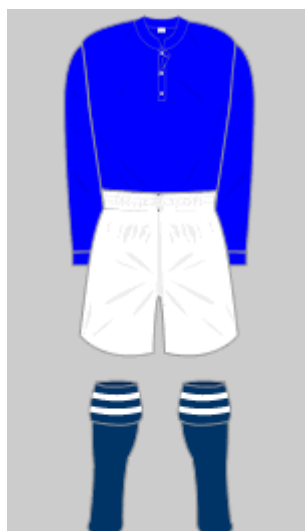
Wick Thistle Season – 1928-29