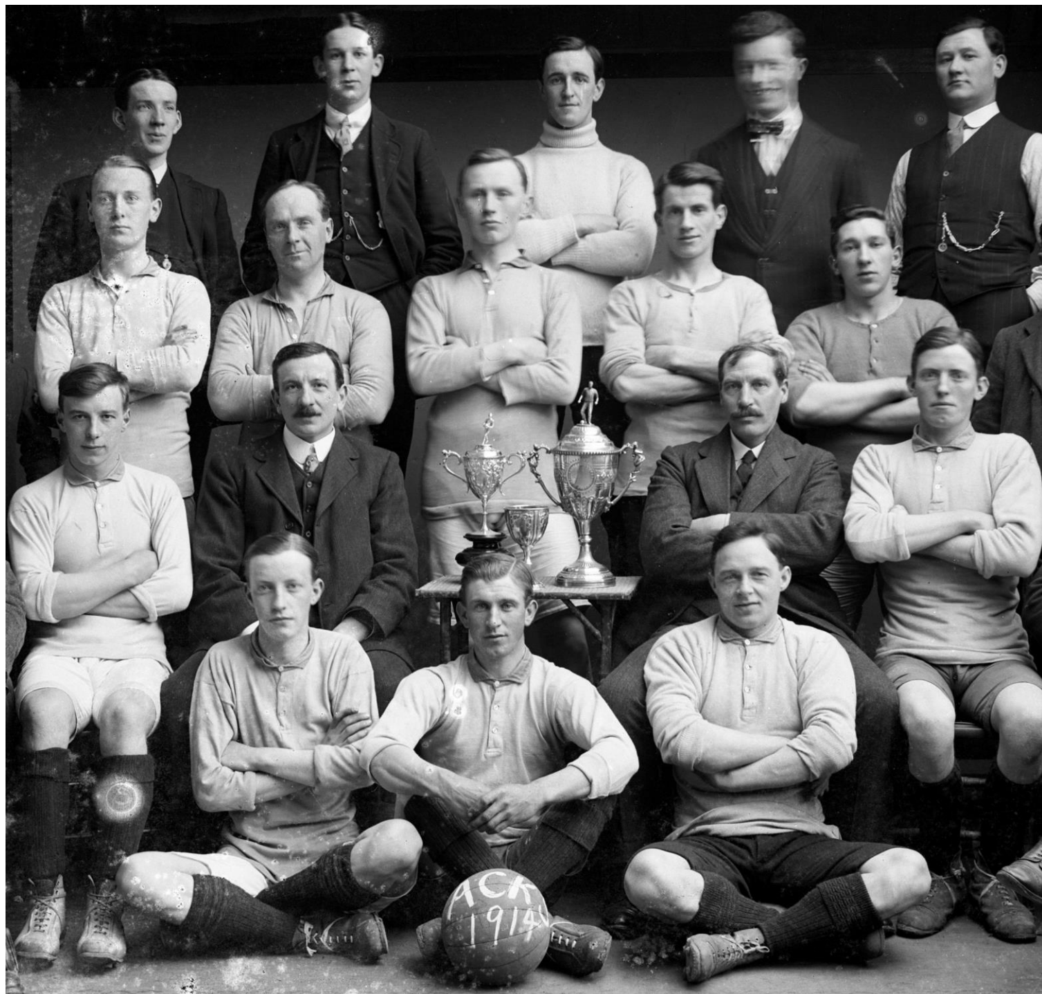
Thurso Academicals Season – 1914 Thurso F.A. Senior League; Stratton Charity Cup & Thurso Cup winners