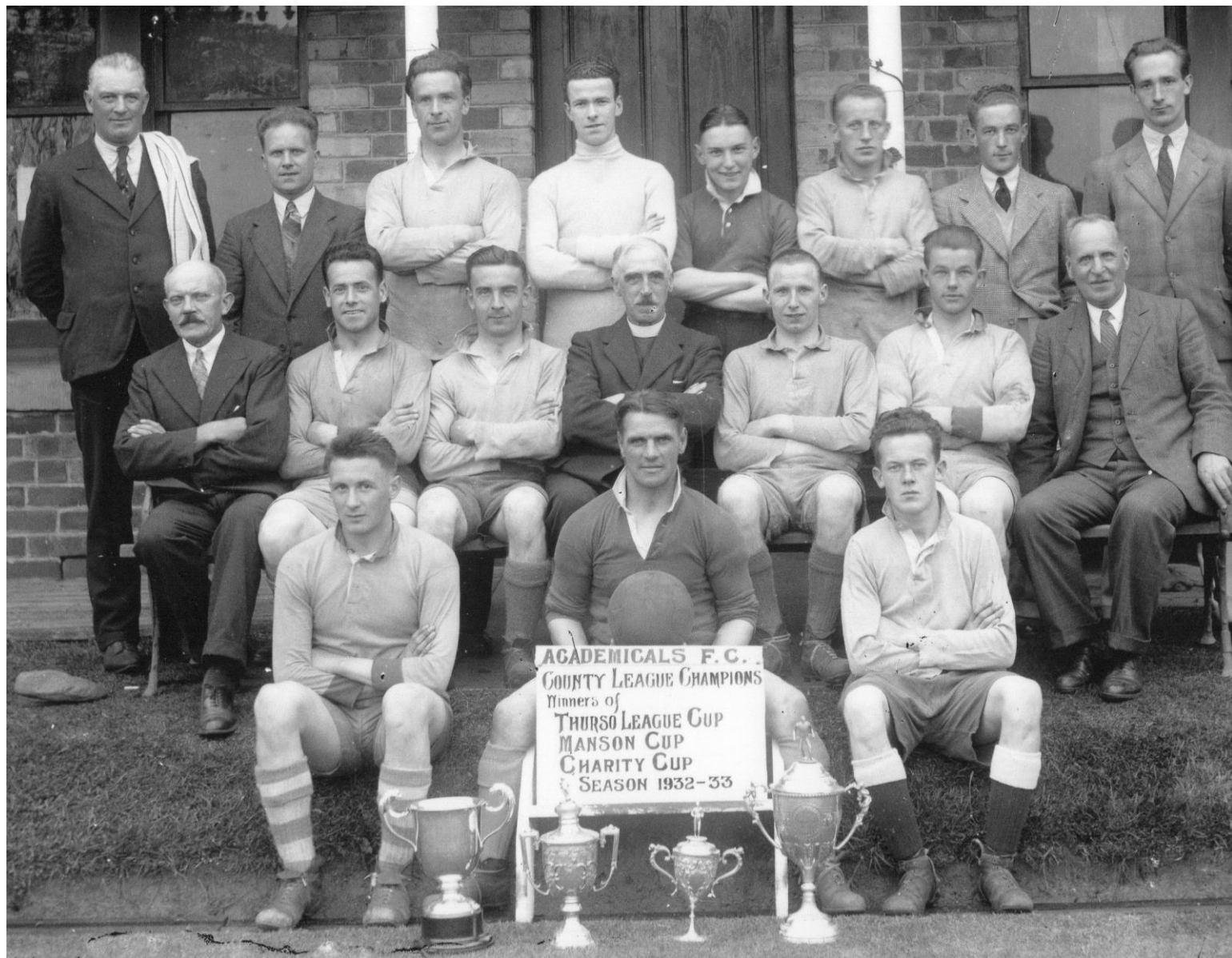
Thurso Academicals Season – 1932-33 County League Champions Thurso F.A. Senior League; Stratton Charity & Manson Cup winners

Thurso Academicals had a very successful playing season in 1932-33. They won the County Championship after a final match with Wick Groats (the first play-off final ever in the competition) and also secured three senior trophies in Thurso-the League, Manson and Charity Cups.