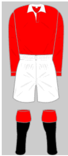
Wick Groats Season – 1950-51