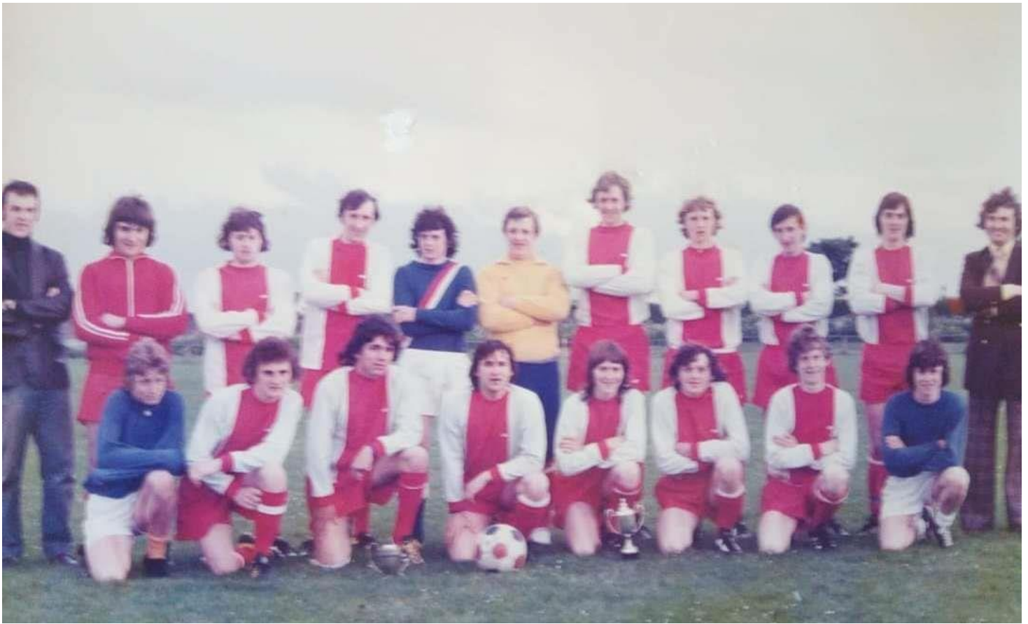
Wick Rangers Supporters Club Season – 1977 County League, Leach Cup, Paterson Cup & Walter Long Cup