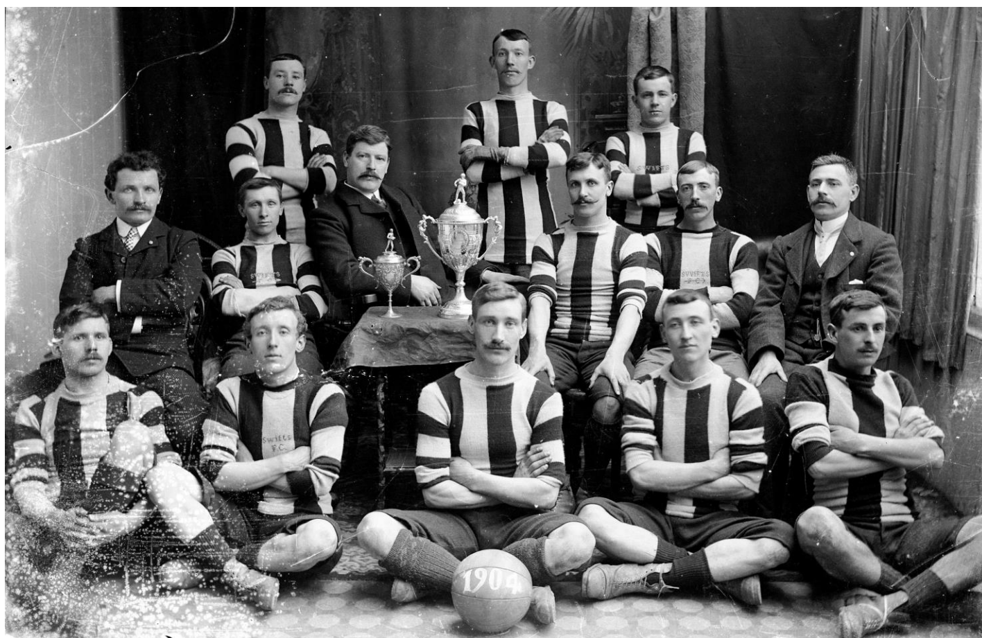
Thurso Swifts Football Club Season – 1904 Thurso F.A. Senior League & Stratton Charity Cup winners

Swifts shared the League title with Academicals