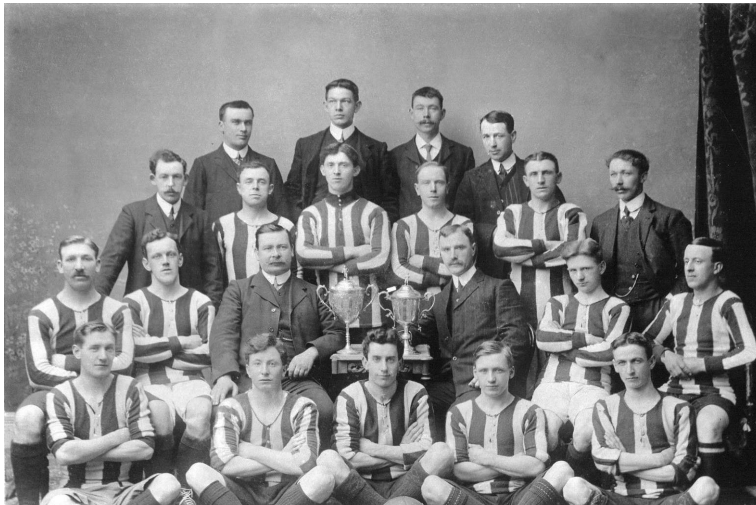
Wick Academy Season – 1908-09

Senior League Champions 1909-10, 11; Charity Cup Winners 1908-09. 10, 11