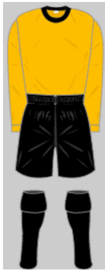
Wick Rovers Season – 1970