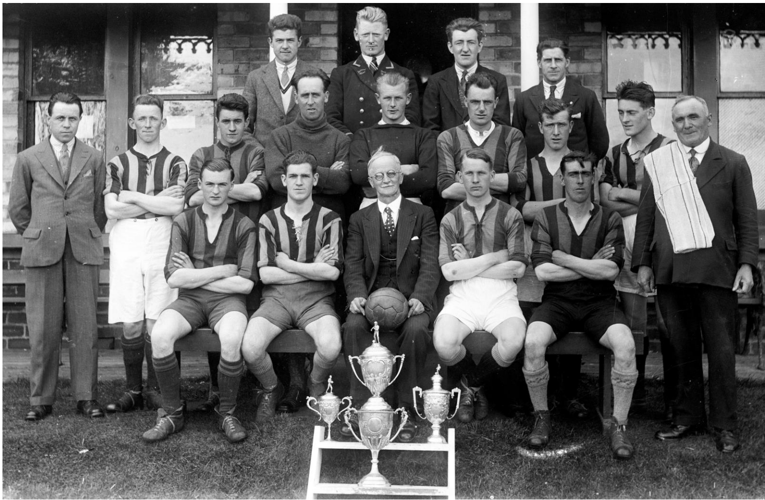
Thurso Pentland F.C. Season – Unknown Thurso F.A. League; Stratton Charity, Miller & Manson Cup winners

Date unknown but thought to be between 1929 to 1932