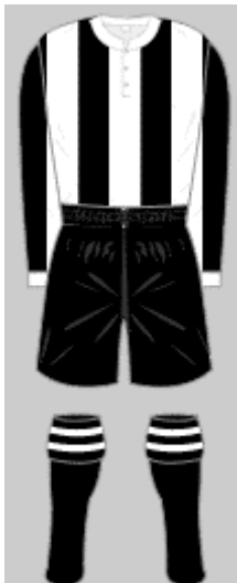
Wick Academy Season – 1912-13