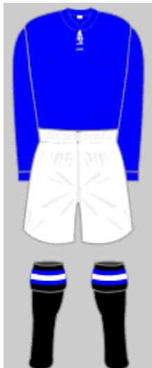
Wick Thistle Season – 1934-35