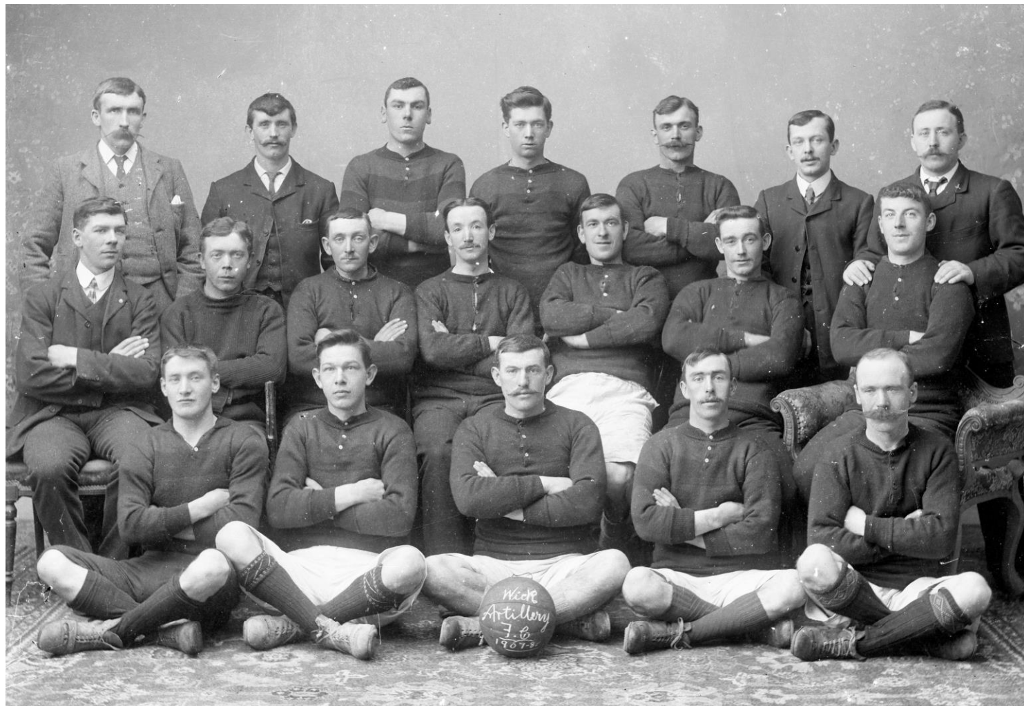
Artillery F.C. Season 1906-07