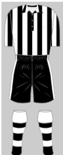
Wick Academy Season – 1953-54