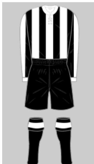
Wick Academy Season – 1930-31