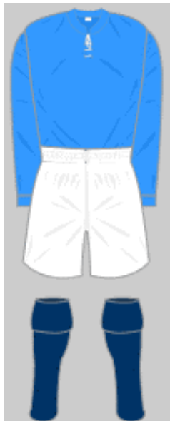
Wick Thistle Season – 1928-29