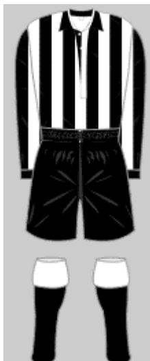
Wick Academy Season – 1950-51