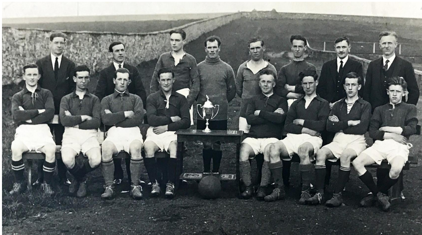
Wick Groats Season – 1928-29