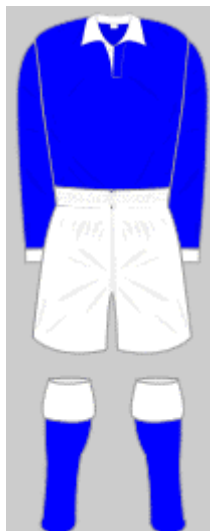
Wick Thistle Season – 1961