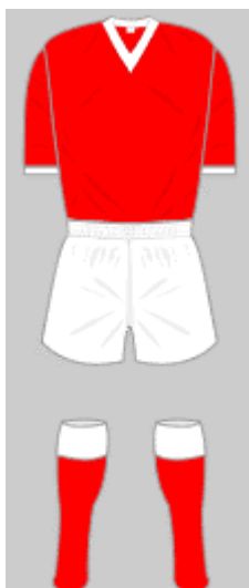
Wick Groats Season – 1957-58

Thus Wick Association's other contests have been completed much earlier than usual and they are able to go ahead with the Charity Cup.