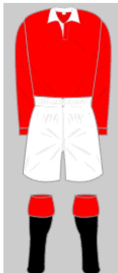
Wick Groats Season – 1951-52