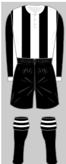
Wick Academy Season – 1923-24