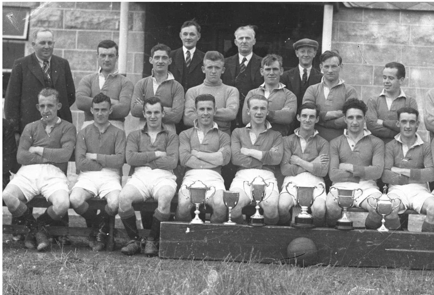
Wick Groats Season – 1936-37