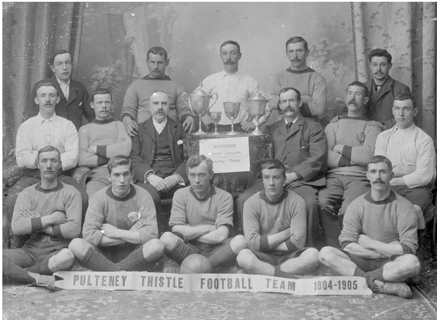
Pulteney Thistle Season – 1904-05