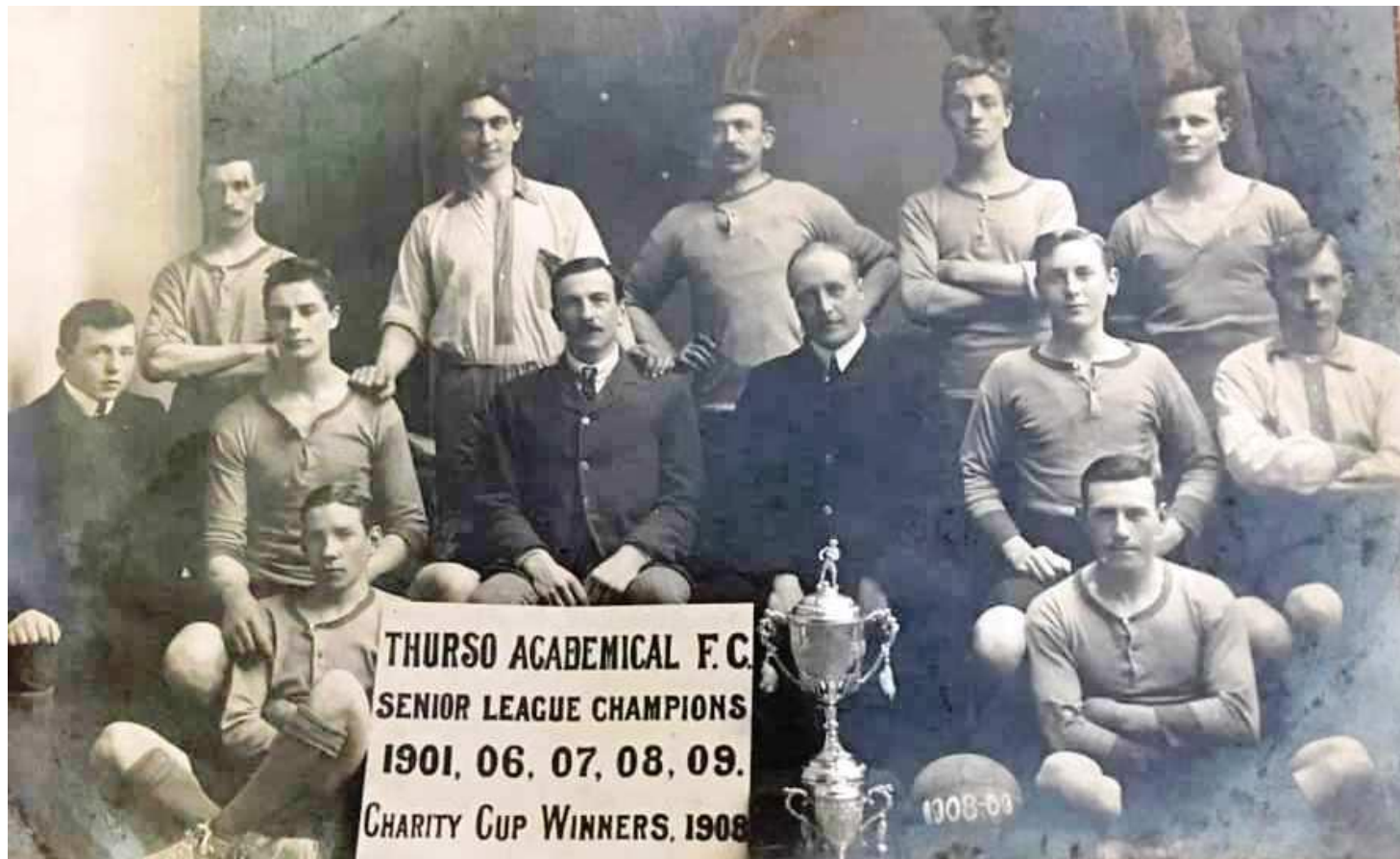
Thurso Academicals Season – 1908-09 Thurso F.A. Senior League & Stratton Charity Cup winners