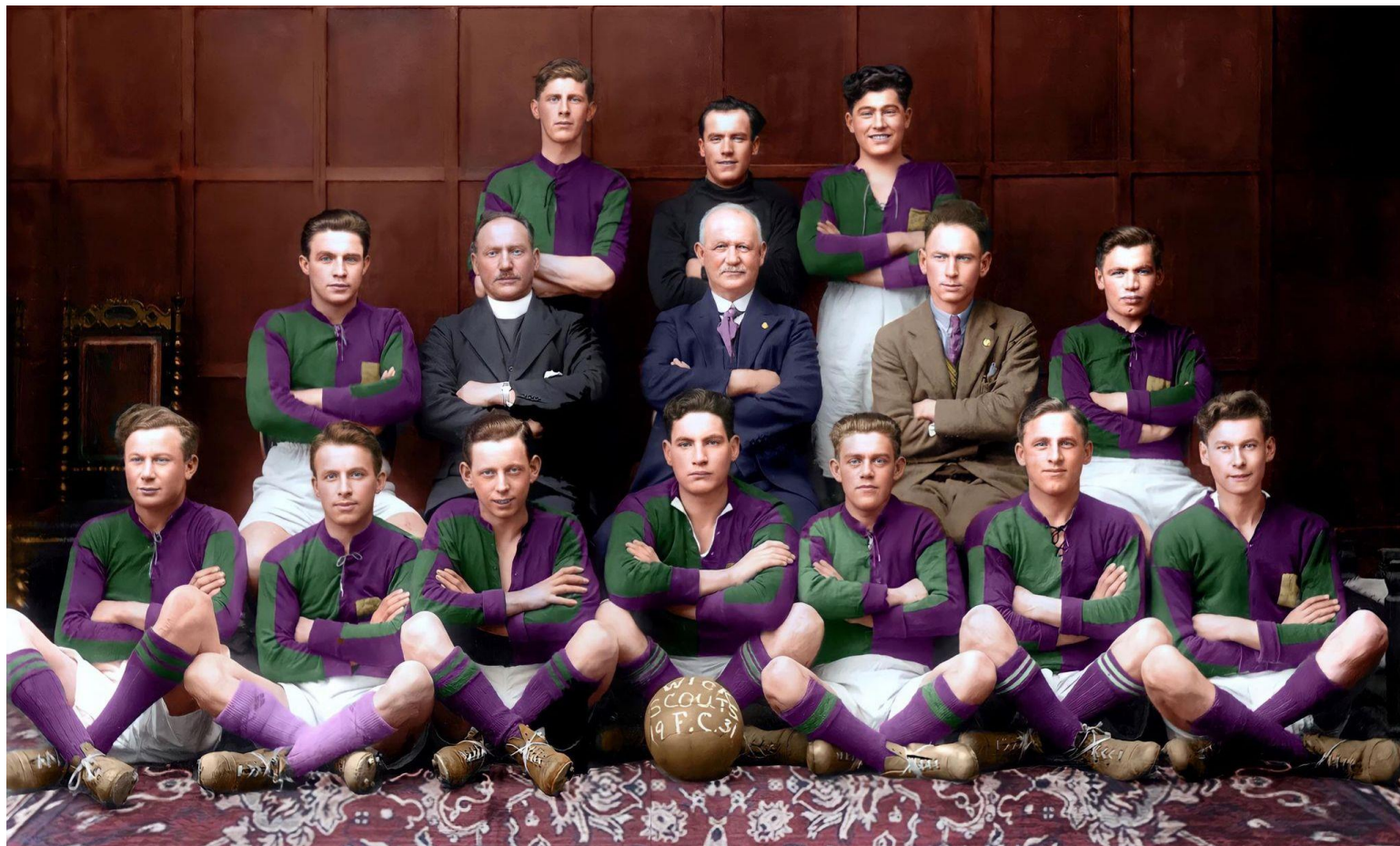
Wick Boy Scouts Football Club Season – 1931

Pictured here above in 1931 is the Wick Boy Scouts football club that was invited to join the Rural League at its inception in 1930 to even up the numbers to six teams. This decision incensed the Lybster Portland football club and its supporters who were excluded from joining the League for reasons not known, although it was widely acknowledged that the Latheron Parish side would prove too strong an opposition for all the rest and Lybster at that time was considered a long distance to travel for regular matches. What ever the reason it was the Scouts who took their place in the league with the ruling that their players were not to be playing for any of the Wick F.A. Senior League teams of Academy, Groats or Thistle.