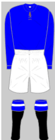
Wick Thistle Season – 1936-37