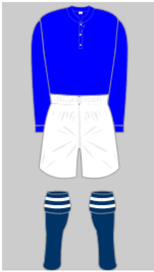
Wick Thistle Season – 1926-27