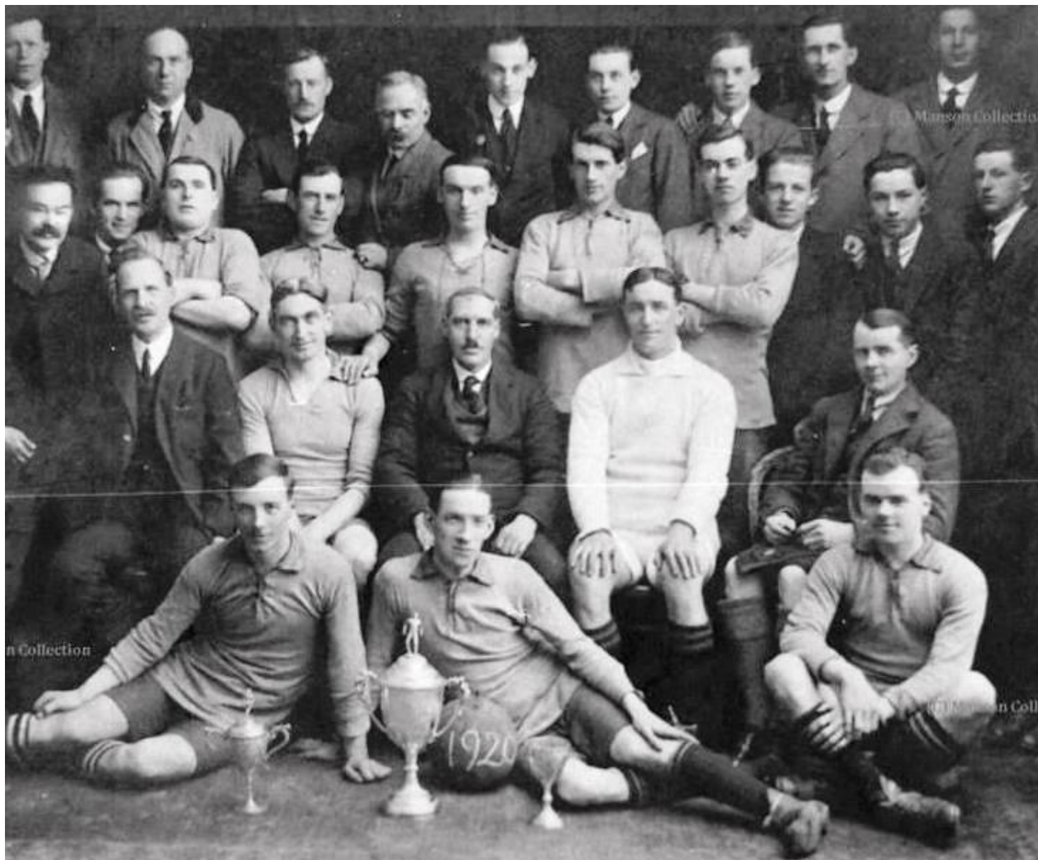
Thurso Academicals Season – 1920 Thurso F.A. Senior League; Stratton Charity & Thurso Cup winners