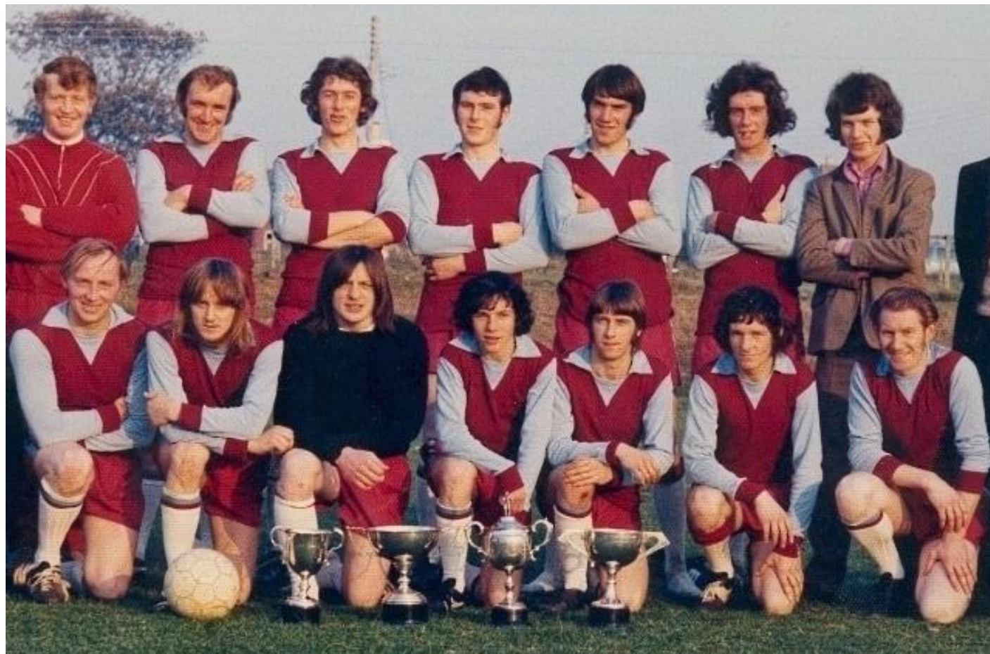
Lybster Portland Season – 1972 Inter-County Miller Cup Wick F.A. Charity Cup, Sinclair Mackay & Cormack Cup winners