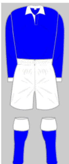
Wick Thistle Season – 1958-59