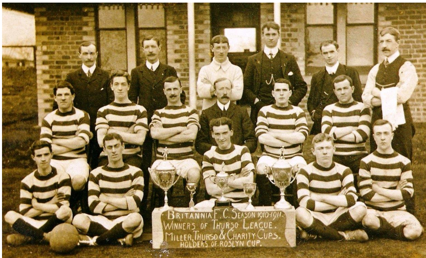
Britannia Football Club Season – 1910-11 Thurso F.A. League; Charity, Miller, Thurso & Roslyn Cup winners