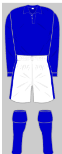
Wick Thistle Season 1947-48

Watten P.O.W. Camp Guards were invited to take part in competition