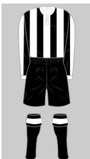
Wick Academy Season 1934-35

Academy winners of all Wick Association trophies for season.