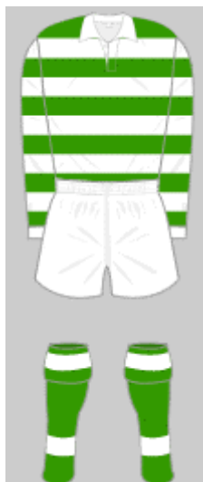
Lybster Portland Season – 1956-57