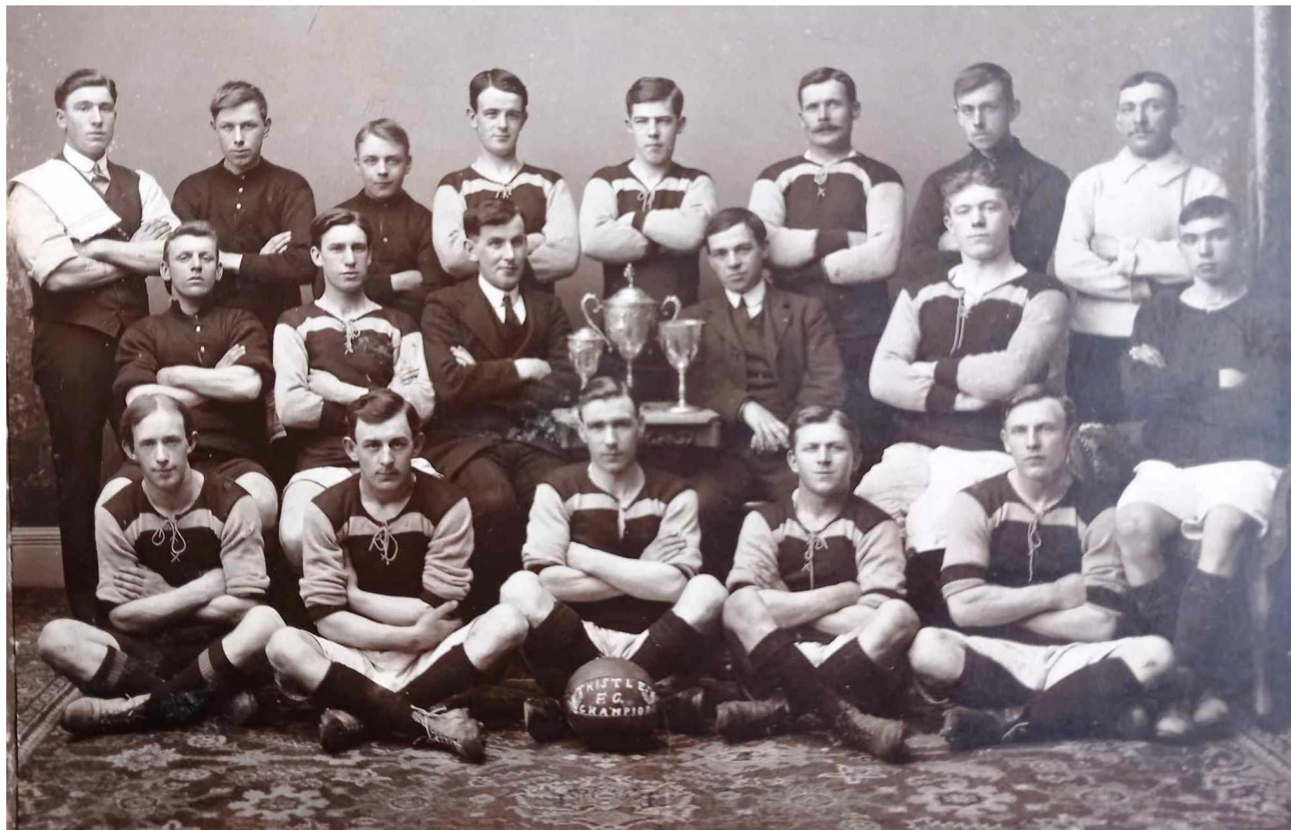
Wick Thistle Season – 1913-14 Wick Senior & Junior League Champions