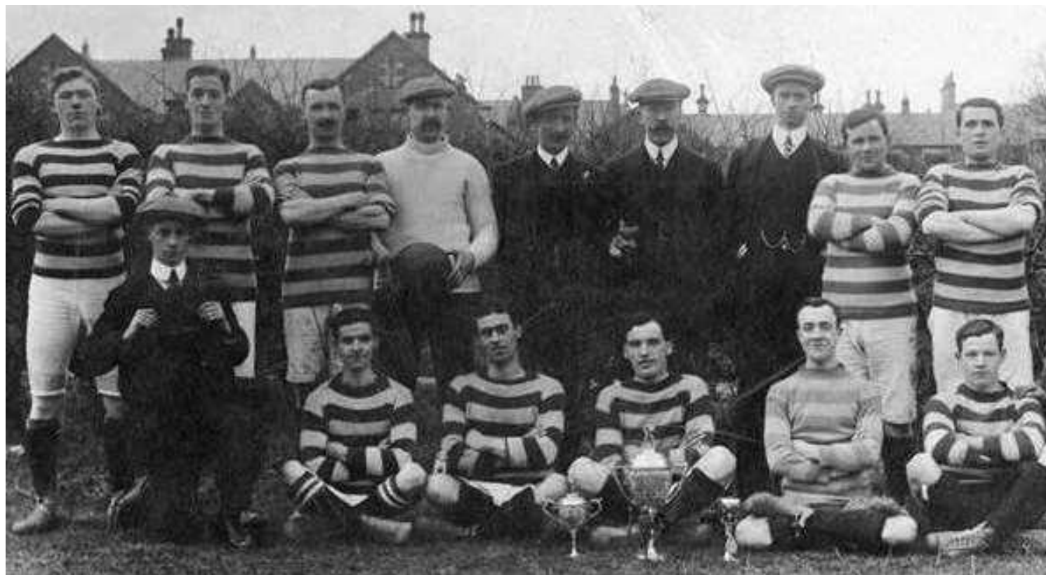
Britannia Football Club Season – 1912-13 Thurso F.A. Senior League; Miller & Roslyn Cup winners