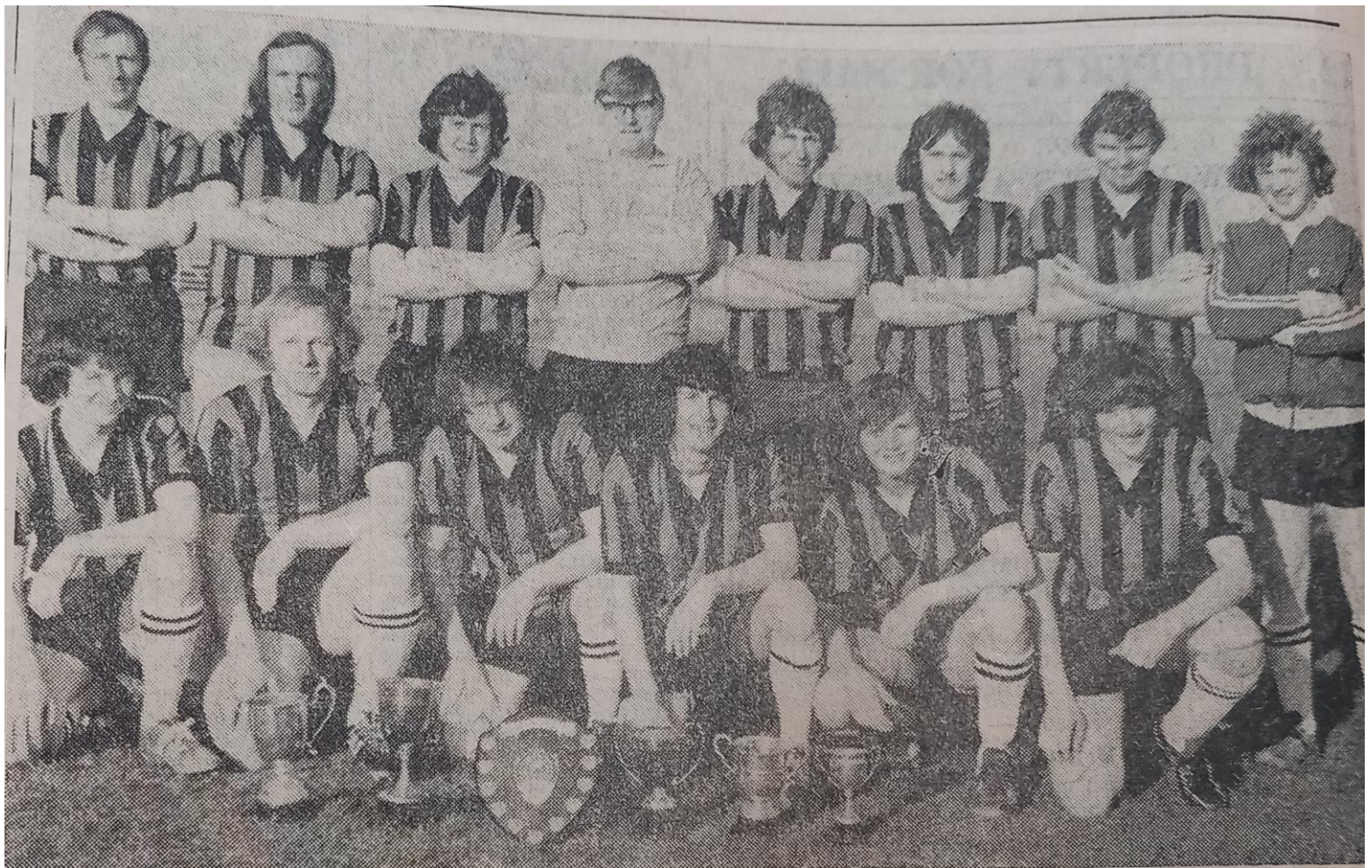
Halkirk Football Club Season – 1974