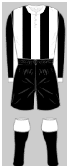
Wick Academy Season 1934-35