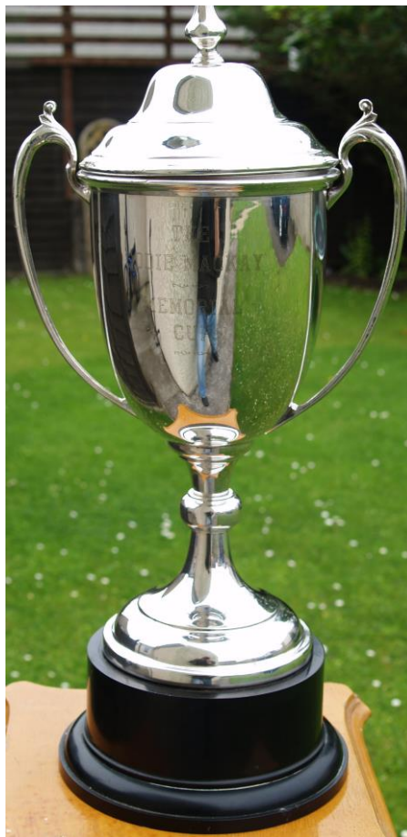
Eddie Mackay Memorial Cup