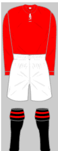
Wick Groats Season 1919-20

#Competition played on knockout basis & Academy received bye into final.