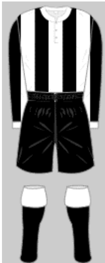
Wick Academy Season – 1949-50