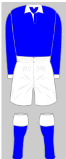
Wick Thistle Season – 1955-56