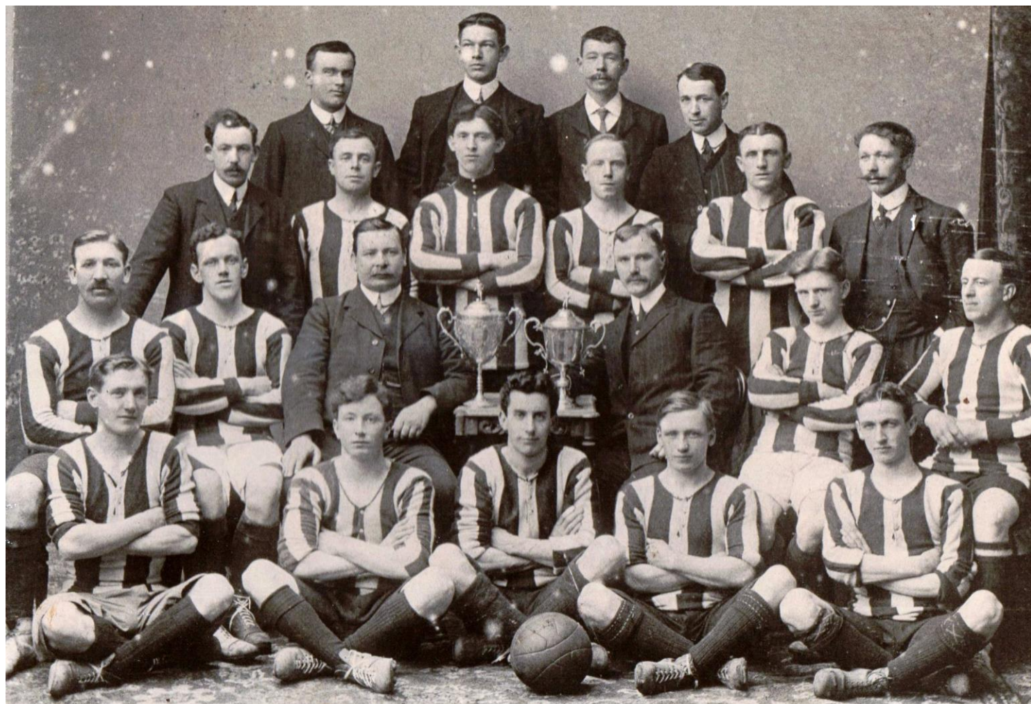
WICK ACADEMY FC.