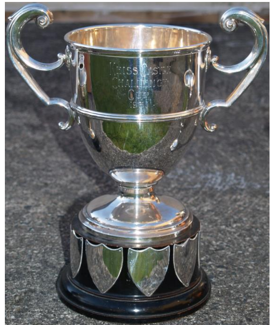
Keiss Castle Challenge Cup 1931 – 1935 (Presented by Keiss Castle Estates)