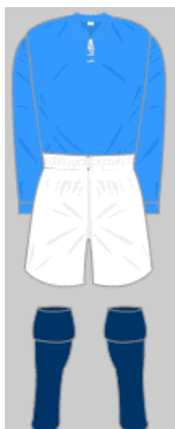
Wick Thistle Season 1924-25