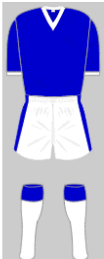
Wick Thistle Season – 1964