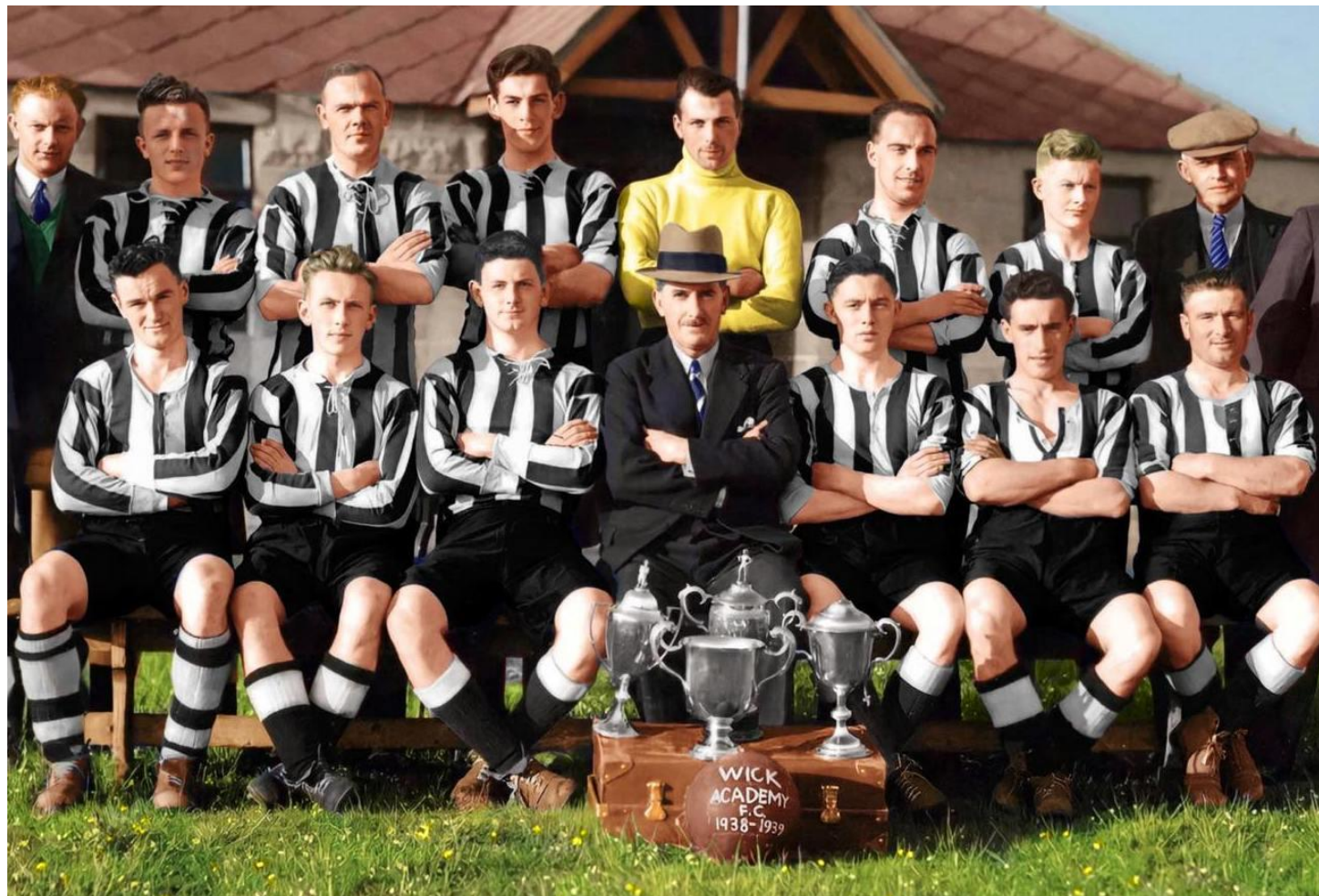
Wick Academy Season – 1938-39