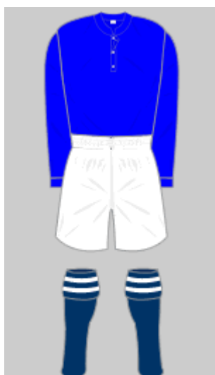
Wick Thistle Season 1925-26