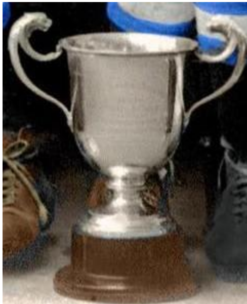
A. J Mackay Cup

Caithness Amateur F.A. and Caithness Rural Football League Amalgamate