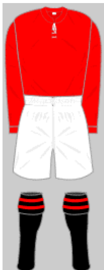
Wick Groats Season – 1932-33