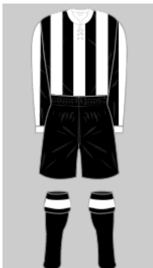
Wick Academy Season – 1913-14