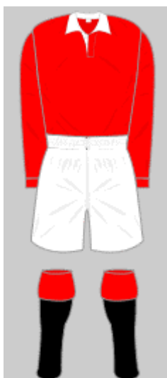
Wick Groats Season – 1937-38