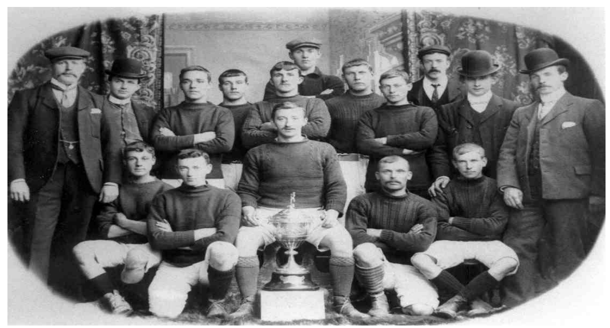
Cellardyke winning side 1903